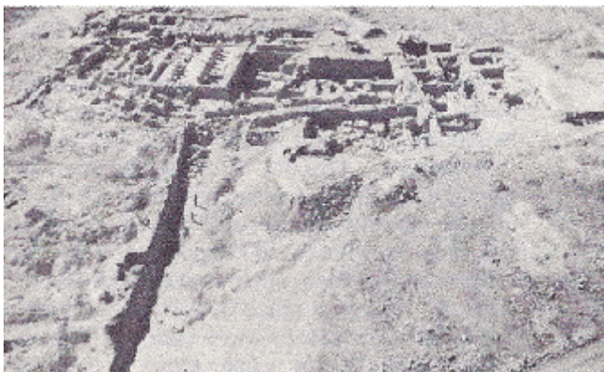
Hazor. Joshua defeated King Jabin of Hazor during the conquest of Canaan (Josh . 11 :1-13; 12:19). King Solomon later fortified the city, but the Assyrians destroyed it in the eighth century B.C. and carried away its people (1 Kings 9:15; 2 Kings 15:29). From 1955 to 1958, Israeli archaeologists led by Yigael Yadin excavated the ruins of Hazor, just northwest of the Sea of Galilee .

Helkath-hazzurim ("field of rock"), an area of smooth ground near the pool of Gibeon (2 Sam. 2: 16).